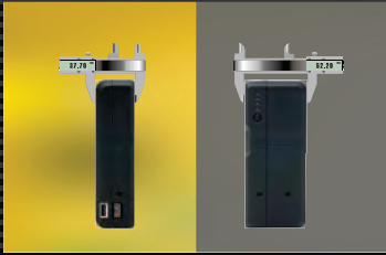
EP-L100V/EP-L100A 30% Slimmer 30% Lighter