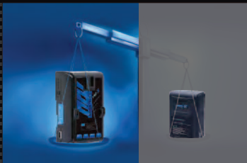
EP-L150V 15% Smaller, 15% Lighter, New Design Package