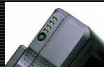
Four-Step Remaining Capacity LED Display

The unique USB port outputs standard DC 5V It can power for mobile devices.